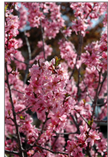
Muckle Plum (tree form) flowers