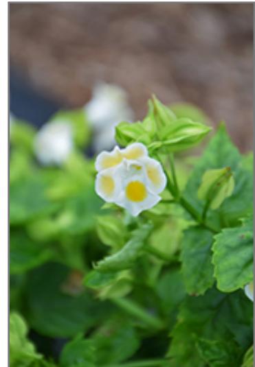
Kauai Lemon Drop Torenia flowers

This plant will require occasional maintenance and upkeep, and should not require much pruning, except when necessary, such as to remove dieback. It is a good choice for attracting bees and hummingbirds to your yard, but is not particularly attractive to deer who tend to leave it alone in favor of tastier treats. It has no significant negative characteristics.