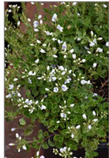
Snowmass Blue-Eyed Veronica flowers

This plant will require occasional maintenance and upkeep, and is best cleaned up in early spring before it resumes active growth for the season. It is a good choice for attracting butterflies to your yard, but is not particularly attractive to deer who tend to leave it alone in favor of tastier treats. It has no significant negative characteristics.