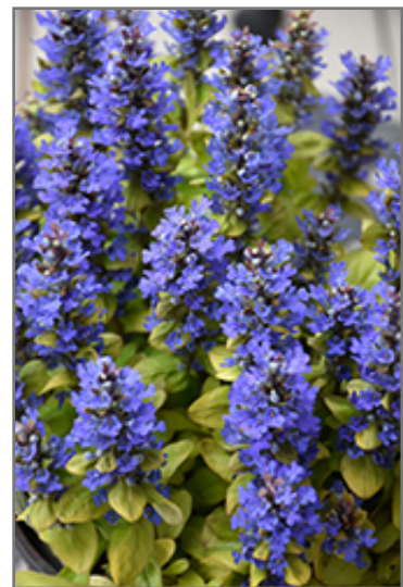
Feathered Friends Petite Parakeet Bugleweed flowers