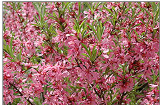
Russian Almond flowers

Russian Almond is recommended for the following landscape applications;