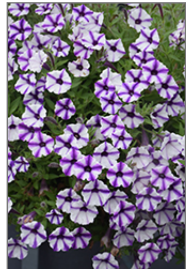
Supertunia Mini Vista Violet Star Petunia flowers

Supertunia Mini Vista Violet Star Petunia is a dense herbaceous annual with a trailing habit of growth, eventually spilling over the edges of hanging baskets and containers. Its medium texture blends into the garden, but can always be balanced by a couple of finer or coarser plants for an effective composition.