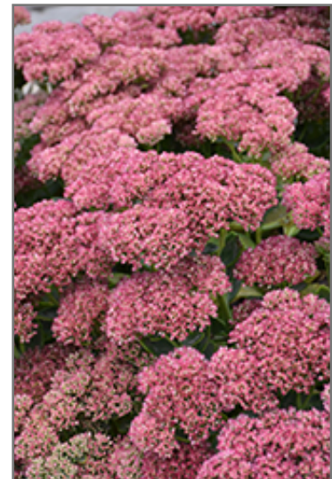
Autumn Fire Stonecrop flowers