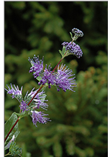
Blue Mist Caryopteris flowers

Blue Mist Caryopteris is recommended for the following landscape applications;