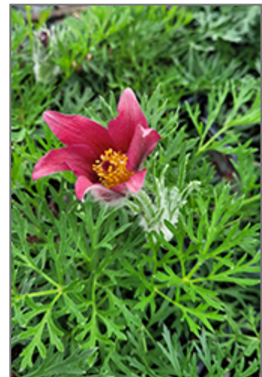
Red Pasqueflower flowers