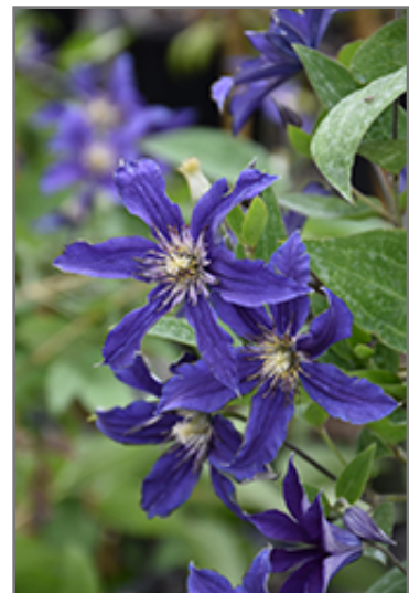
Sapphire Indigo Clematis flowers