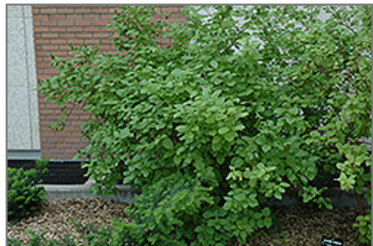
Siberian Dogwood