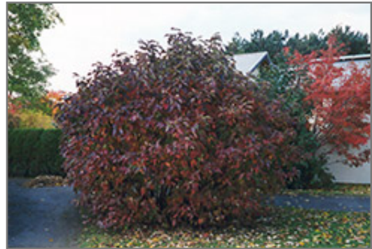
Siberian Dogwood in fall

* This is a 'special order' plant - contact store for details