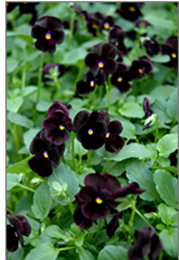
Sorbet Black Delight Pansy flowers

Sorbet Black Delight Pansy is an herbaceous perennial with a mounded form. Its relatively fine texture sets it apart from other garden plants with less refined foliage.