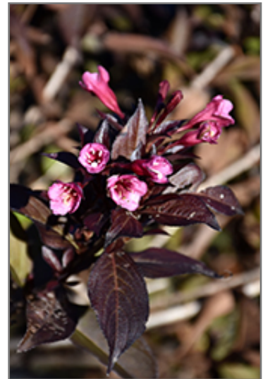
Fine Wine Weigela flowers