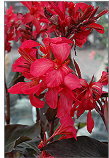
Australia Canna flowers

This plant should only be grown in full sunlight. It requires an evenly moist well-drained soil for optimal growth, but will die in standing water. It is not particular as to soil pH, but grows best in rich soils. It is highly tolerant of urban pollution and will even thrive in inner city environments, and will benefit from being planted in a relatively sheltered location. Consider applying a thick mulch around the root zone in winter to protect it in exposed locations or colder microclimates. This particular variety is an interspecific hybrid. It can be propagated by division; however, as a cultivated variety, be aware that it may be subject to certain restrictions or prohibitions on propagation.