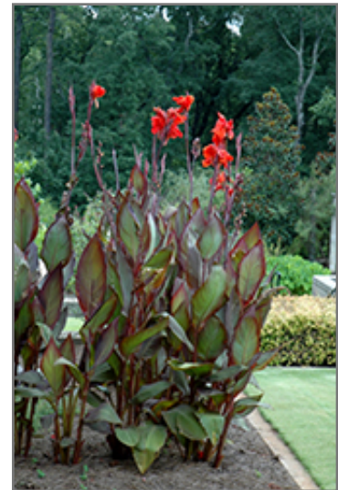
Australia Canna in bloom