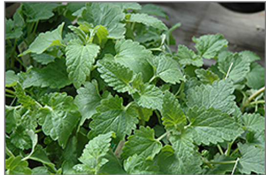
Catnip foliage

This plant will require occasional maintenance and upkeep, and is best cleaned up in early spring before it resumes active growth for the season. It is a good choice for attracting bees and butterflies to your yard, but is not particularly attractive to deer who tend to leave it alone in favor of tastier treats. Gardeners should be aware of the following characteristic(s) that may warrant special consideration;