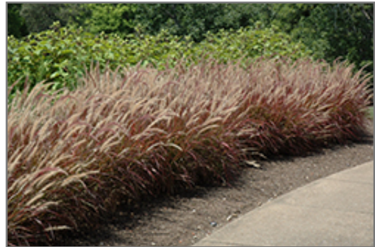
Purple Fountain Grass in bloom

Purple Fountain Grass will grow to be about 4 feet tall at maturity, with a spread of 3 feet. Although it's not a true annual, this plant can be expected to behave as an annual in our climate if left outdoors over the winter, usually needing replacement the following year. As such, gardeners should take into consideration that it will perform differently than it would in its native habitat.