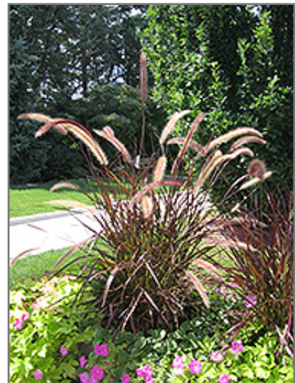
Purple Fountain Grass flowers

Purple Fountain Grass is recommended for the following landscape applications;